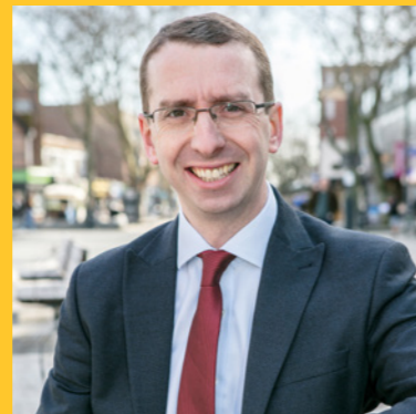
FOREWORD BY OUR ELECTED MAYOR