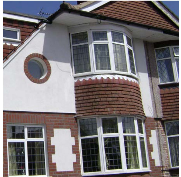
This is an example of an insulated Watford property that used a combination of smooth render with a brick finish.

* The Energy Savings Trust estimates typical savings for a semi-detached property of £225 per year from your heating bills and savings of 930 kg of Carbon dioxide every year.